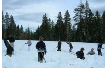
Students building a quinzee at the Rideout program